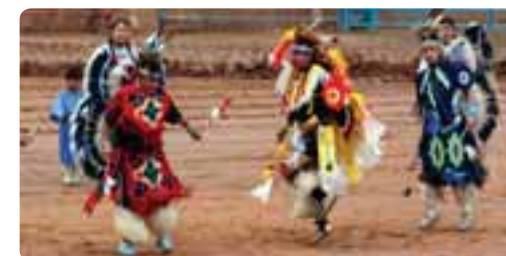
Ceremonial Indian dance