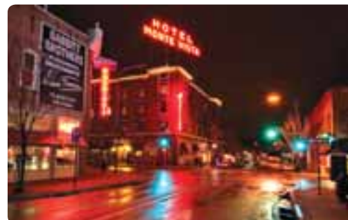
Downtown Flagstaff at night