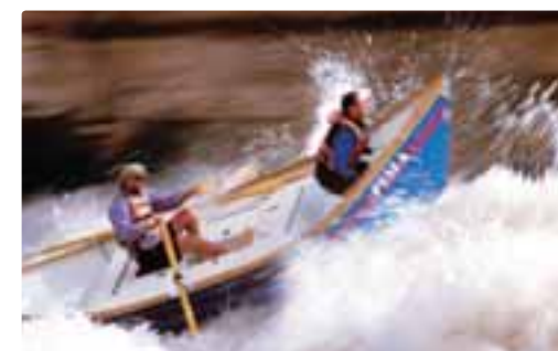
A dory in Upset Rapid, Colorado River