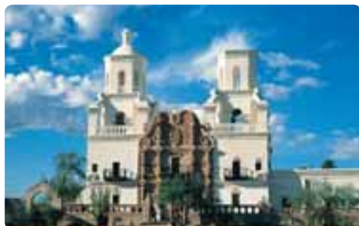
Mission san Xavier del Bac, Tucson