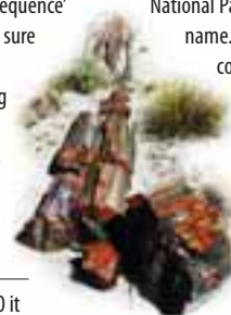
Above: Remains of the Petrified Forest