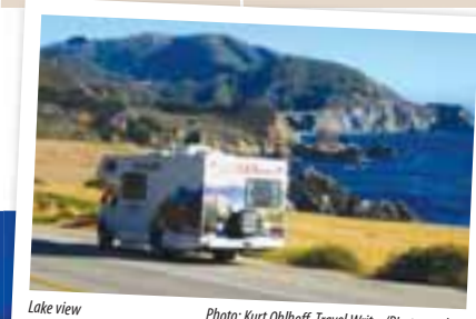
Lake view

DAY 8 > Only a fifteen mile drive to return your motorhome to Cruise America today.