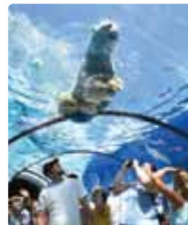
Arctic Ring of Life, Detroit Zoo

DAY 6 > If you have children on board, or just if you are young at heart, do stop after 80 or so