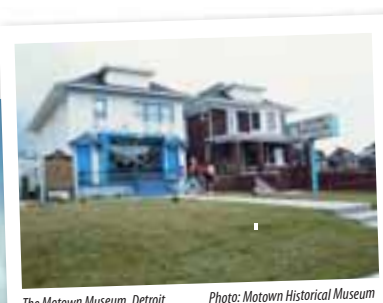
The Motown Museum, Detroit