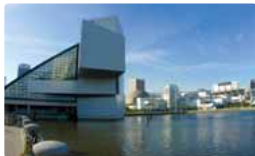
Rock and Roll Hall of Fame, Cleveland