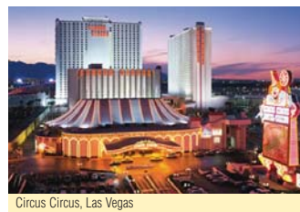
Circus Circus, Las Vegas

Day 8/9 Heading for Las Vegas – and a two night stay at the Circus Circus KOA campground. It is almost a seven hour drive, mainly freeway, but worth it to get to the 'fun capital'! NB: If you are feeling brave enough to extend this journey, and you are travelling between October and May, a route through Death Valley may be your choice but be