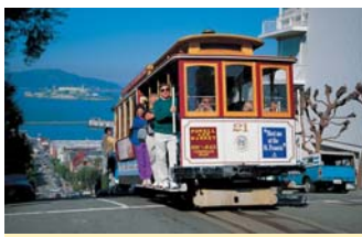
Tram, San Francisco

Day 3/4 Dying to get going towards San Francisco today? Please, be sure to stop at that well-known 'Folly', Hearst Castle, as you drive through San Simeon – 65 miles into your journey. Take time to enjoy amazing coastal scenery through the Big Sur and Pebble Beach; with maybe a stop at Carmel or Monterey. Then cross the famous Golden Gate Bridge. You are heading for the Petaluma KOA , 34 miles north of that famous icon. A petting farm with cattle, sheep, donkeys, goats and peacocks enhances the ranch atmosphere at this campground. Summertime fun includes an inflatable water slide; bounce house and sunset hayrides – so plenty to do as well the option to take guided tours of San Francisco, which depart daily May through October. Enjoy a second night at Petaluma KOA.