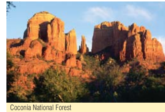
Coconino National Forest

Driving time: 54 hours (3 hrs per day average)